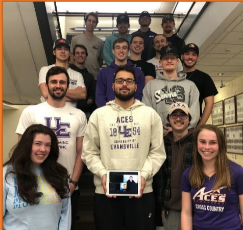
NASA Rover Team