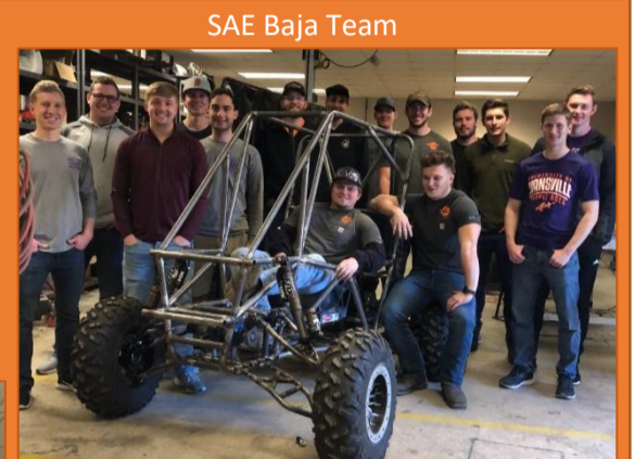
SAE Baja Team

The senior-led project teams that incorporated underclassmen included the SAE Baja Team, the NASA Rover Team, and the Thermosiphon team. As most teams celebrate the culmination of their work over the academic year, the SAE Baja team will conclude their work at competition later this month.