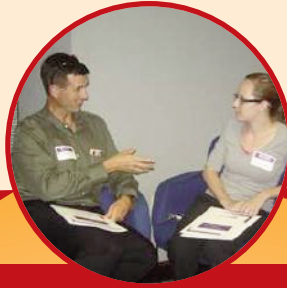
UE mentor and student mentee meet and introduce themselves for the first time.