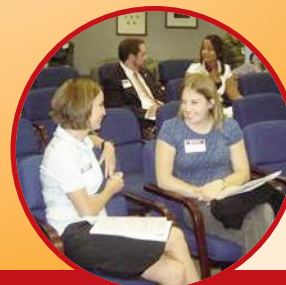
UE student and UE alumna mentor

To find out how you can volunteer with partners, visit www.evansville.edu/partners