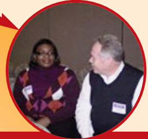
Student mentee and UE alumnus mentor