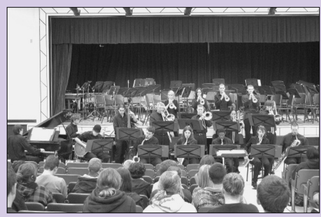
In November the Wind and Jazz Ensembles performed for the band students at Henderson (KY) County High School.