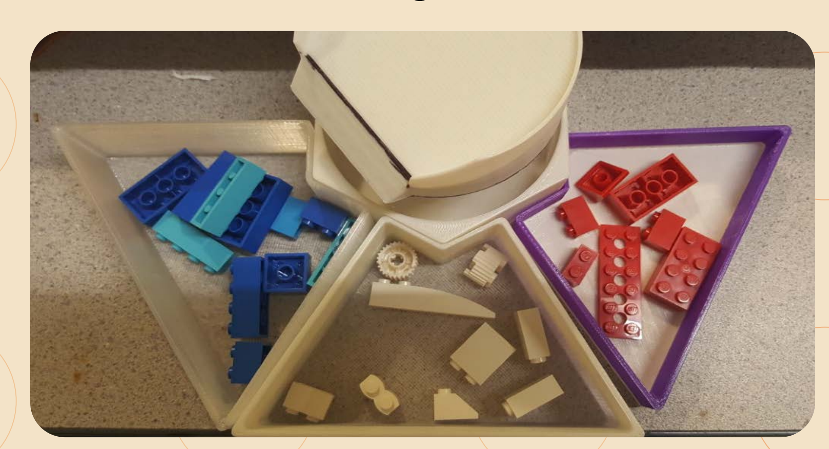
Legos in Bins