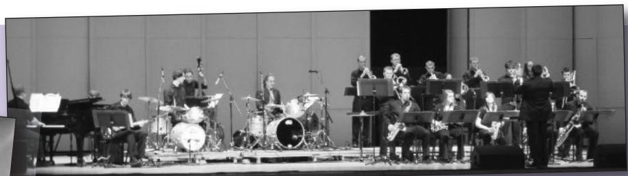
Jazz Ensemble on stage with Max Weinberg at The Victory Theatre