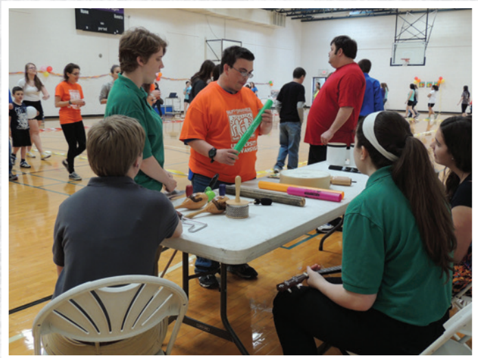
UEMTA partnered with the UE Best Buddies to sponsor a Friendship Walk to raise money for the state and campus chapters. The walk featured themed laps, our music table, and crafts and snacks. Buddies and members of the campus community had fun walking to raise money for Best Buddies, participating in the activities, and hanging out as friends.