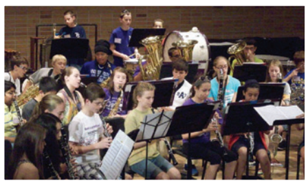
Students at the 2014 Wesley Shepard Summer Music Camp