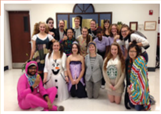
Above, students posed for a picture after engaging residents of Good Samaritan Home in Evansville in singing, movement, and Name That Tune. Residents were presented a bag with a few goodies and a few chuckles by the costume-clad students. At the end of the semester, music therapy students also shared their music and holiday spirit during caroling at St. Mary's Hospital.