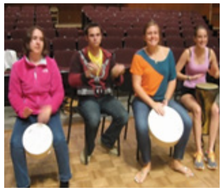
Members of the University of Evansville Music Therapy Association (UEMTA) led two Drum Circles this semester, one of which was to welcome students and family members to campus for Family Weekend.