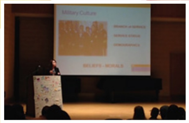
Students traveled to Indiana University-Purdue University Ft. Wayne to attend a one day MT Student Cooperative Workshop for music therapy students from across the state. They learned about the issues and problems facing veterans and their families upon return from combat and how art therapists use art and music in their clinical work. The students participated in two therapeutic art activities that could also be used in combination with music experiences.