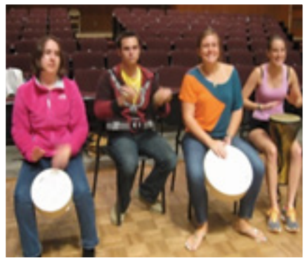
Members of the University of Evansville Music Therapy Association (UEMTA) led two Drum Circles this semester, one of which was to welcome students and family members to campus for Family Weekend.