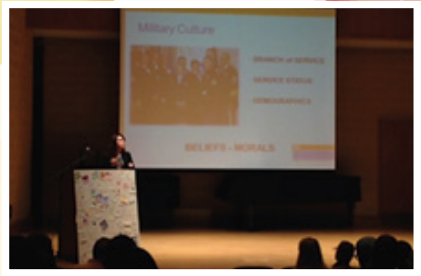
Students traveled to Indiana University-Purdue University Ft. Wayne to attend a one day MT Student Cooperative Workshop for music therapy students from across the state. They learned about the issues and problems facing veterans and their families upon return from combat and how art therapists use art and music in their clinical work. The students participated in two therapeutic art activities that could also be used in combination with music experiences.