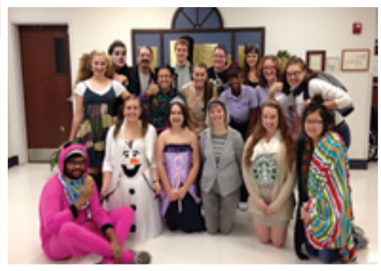
Above, students posed for a picture after engaging residents of Good Samaritan Home in Evansville in singing, movement, and Name That Tune. Residents were presented a bag with a few goodies and a few chuckles by the costume-clad students. At the end of the semester, music therapy students also shared their music and holiday spirit during caroling at St. Mary's Hospital.