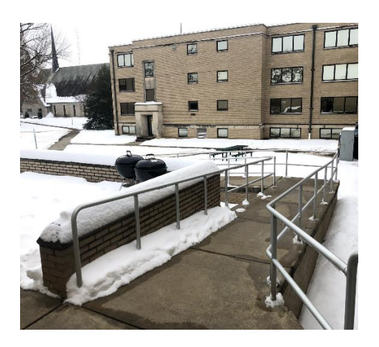
The laundry room, kitchen, computer lab, and study rooms are in the basement and are not accessible.