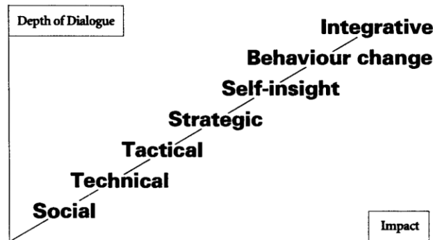
Diagram 1: The Seven Layers of Mentoring

to ensure that the partner's needs are being met. The seven dialogue layers include social, technical, tactical, strategic, self-insight, behaviour change, and integrative. In this article we briefly describe the purpose of each layer and provide concrete ideas about how to engage in dialogue at each level.