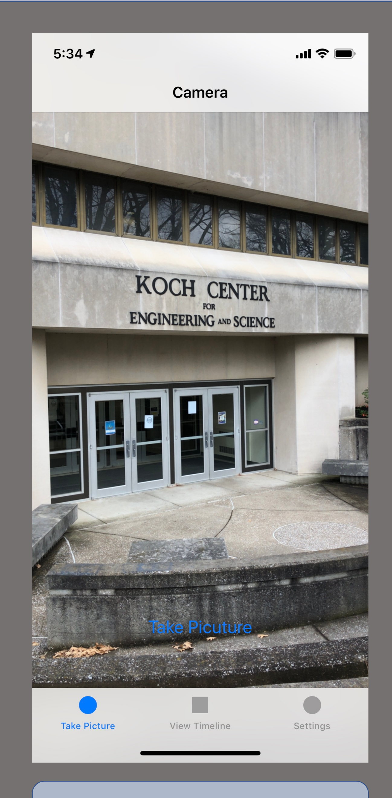
Taking a Picture

This project resulted in an iOS application that allows users to share and upload photos based on a user's location. The main views in the application are for taking pictures, confirming to save a picture, selecting a radius of pictures to view, and a timeline view to display the relevant photos. The app also has user accounts which allow for user specific features. Overall, this application has fulfilled the requirements of the project