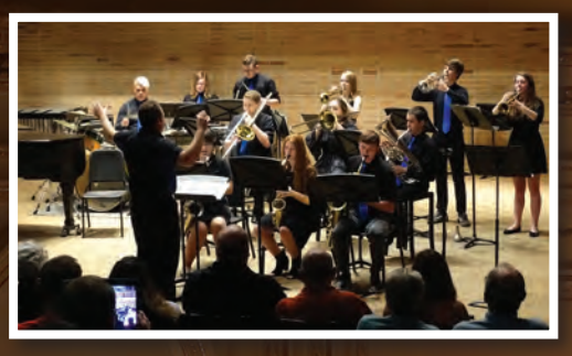
UE Jazz Invitationals

Central Division Conference of the American Choral Directors Association (2016); Indiana Music Education Conference (2010, 2013)