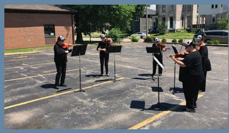
Brentwood Living Center