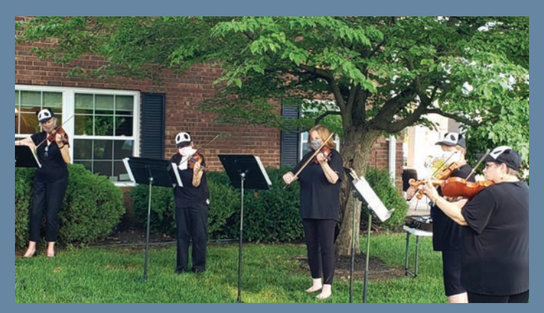
Newburgh Health Care