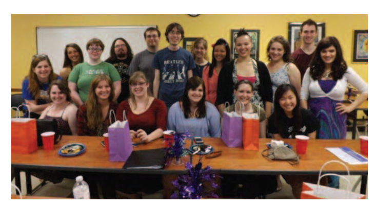
Members of the 2013 graduating class attended this year's Senior Send-Off.