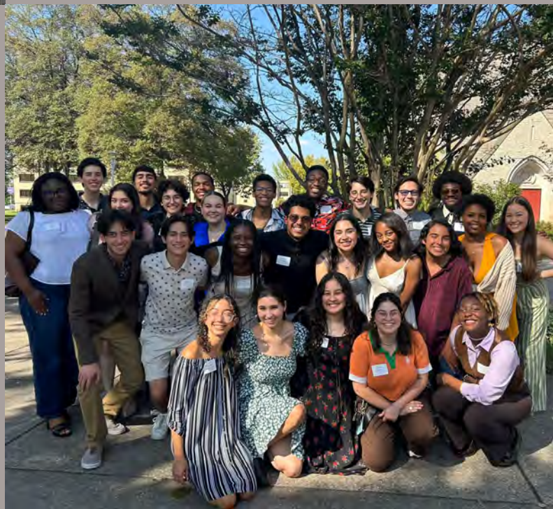
Theatre Society Adopt-a-Student Picnic

For over 50 years, arriving first-year students have been welcomed to campus by the University of Evansville Theatre Society—a dynamic group of volunteers expressly created to give students a sense of belonging in the Evansville community. The UE Theatre Society assists and nurtures the students during their four-year experience in a variety of ways, including a kick-off dinner for the first-year students and board members; an exciting Adopt-a-Student program, where students are “adopted” by local families at a luncheon in the first semester; opening night parties at local restaurants; annual trips to regional theatres to expose students to professional productions; an end-of-year Student Awards Dinner; and a post-commencement reception for graduating seniors and their families.