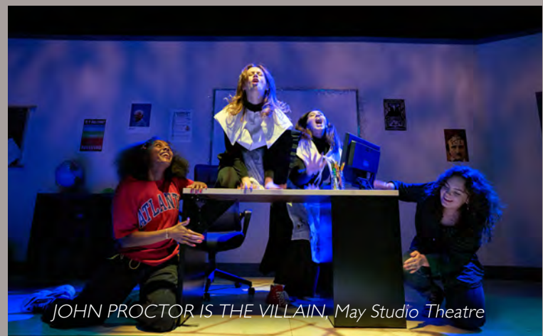
JOHN PROCTOR IS THE VILLAIN, May Studio Theatre

UE Theatre productions provide purposeful experiences tailored to challenge and cultivate growth in an individual student's path as a theatre artist. Students have the opportunity to work in all three venues: the 482-seat Shanklin Theatre, the versatile May Studio Theatre, and the newly created John David Lutz Theatre Lab.