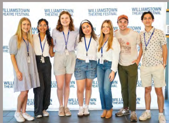
These talented and ambitious students provided support services for the Box Office, Operations, and Development teams for the daily work at the Williamstown Theatre Festival.

UE Theatre takes a comprehensive approach to preparing students to enter the workforce as empowered and generous theatre artists. In addition to rigorous classroom and practical theatre experiences, students complete self-reviews each semester. The senior year features classes in Audition Techniques and the Business of Acting, as well as Portfolio Preparation and Career Development. Summer work experiences also play an invaluable role in helping UE Theatre students transition into the professional world. UE Theatre students regularly secure positions at prestigious institutions, such as the Williamstown Theatre Festival, Eugene O'Neill Theater Center, Utah Shakespeare Festival, Santa Fe Opera, The Glimmerglass Festival, The Juilliard School, Alley Theatre, Playwrights Horizons, and many others. However, the “secret sauce” may be the networking opportunities provided at alumni events held each year in New York, Chicago, and Los Angeles.