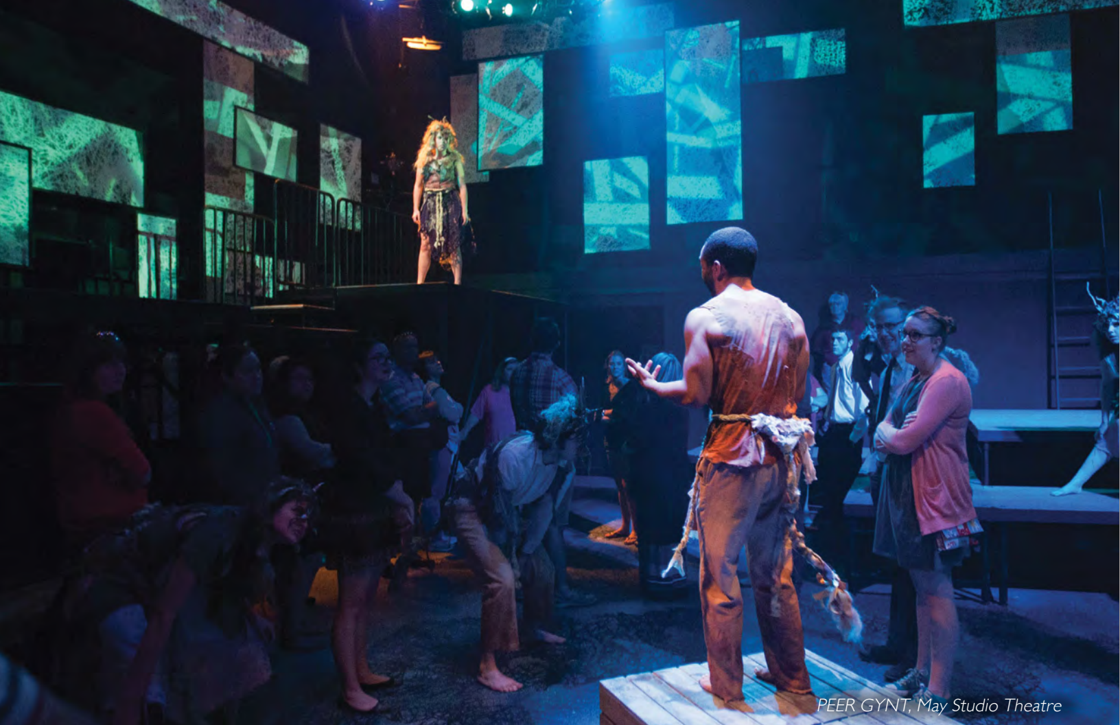
PEER GYNT, May Studio Theatre