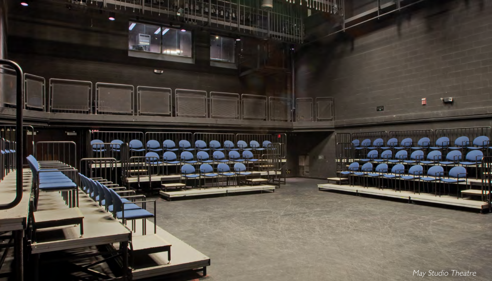
May Studio Theatre