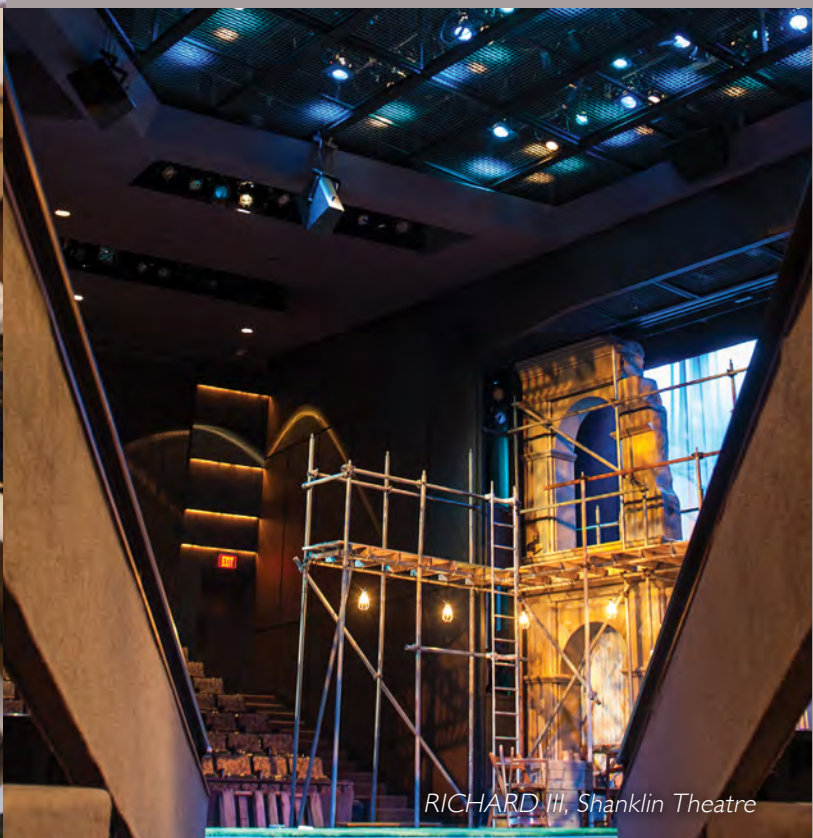
RICHARD III, Shanklin Theatre