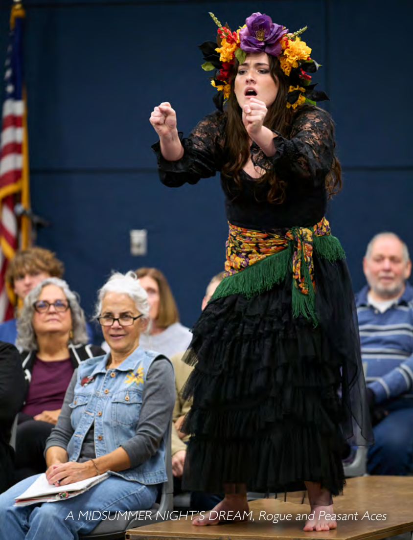
A MIDSUMMER NIGHT'S DREAM, Rogue and Peasant Aces