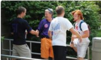
Openings, Closings and Breaks